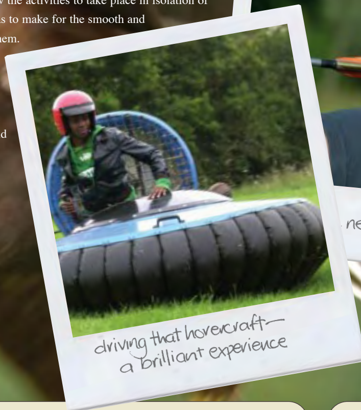
next Robin Hood!

At our shooting grounds, our team of professional instructors will ensure that all aspects of your day will run smoothly, efficiently and safely, as would be expected from Holland & Holland.