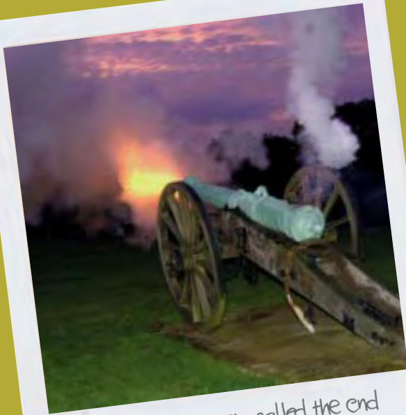
the cannon signalled the end of a wonderful day

It is this commitment that ensures we remain the U.K. market leader in this fast growing business sector.