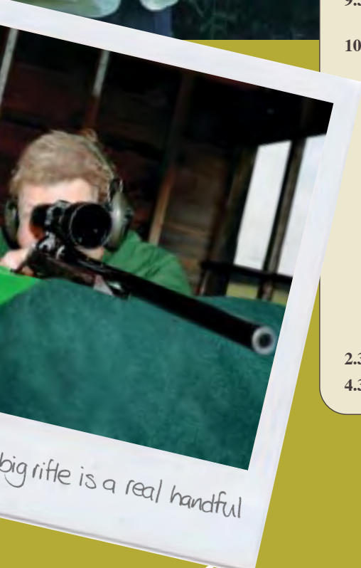
big rifle is a real handful