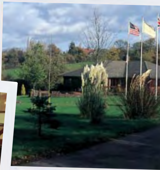
an oasis of green only 17 miles from London