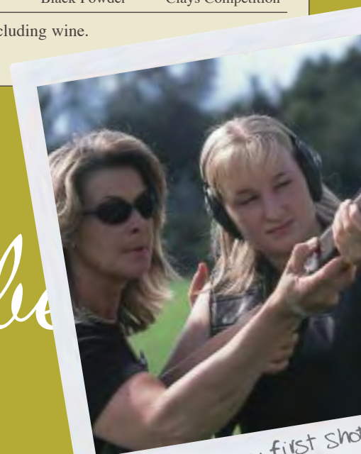
a hit with my first shot