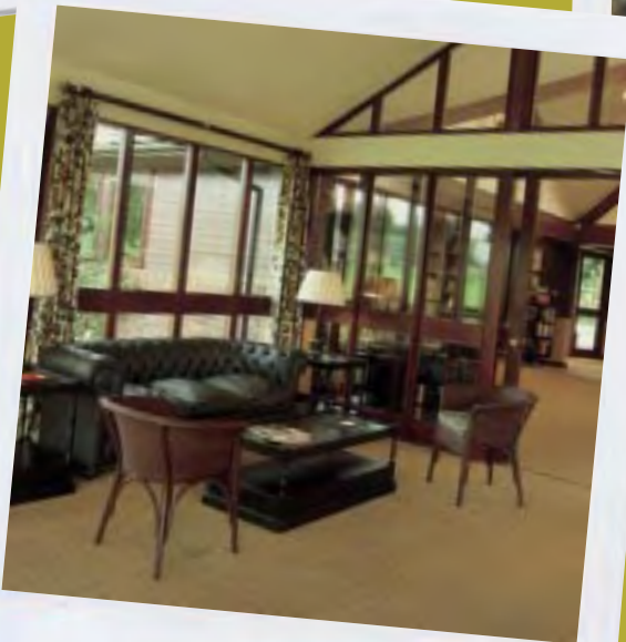
the smart, relaxing lounge